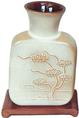
V-14—DESERT GOLD/COFFEE 20.00