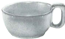
4SC—5" CUP-BOWL 3.75