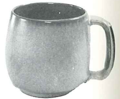
4M—4½"—18 OZ. MUG 4.50