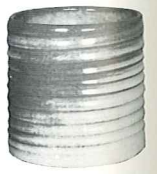
272—4" RINGED CYLINDER VASE 3.25