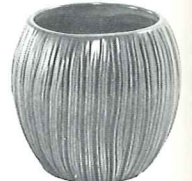
T7—3½" COCONUT PLANTER 2.75