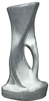
95—8½" FREE FORM VASE 6.50