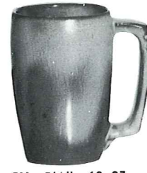
5M—5½"—16 OZ. MUG 4.50