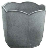
37—4" HEXAGONAL PLANTER 3.25