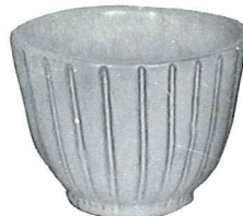
176—4" PLANTER 4.00