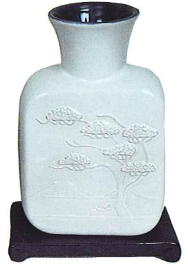
V-14—WHITE/NAVY BLUE 20.00