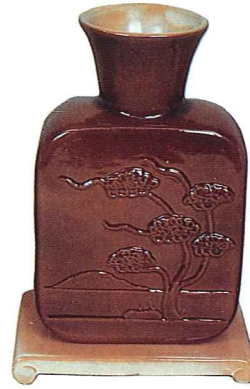
V-14—COFFEE/DESERT GOLD 20.00